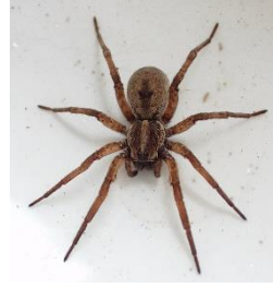
A SMALL SPIDER