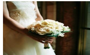
A BRIDE'S BOUQUET